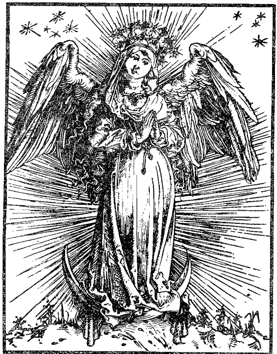
Detail from The Woman clothed with the Sun . Albrecht Dürer (1503).

The May issue of the Newsletter will contain a listing of summer festivals. We will do our best to compile this information, but would appreciate help from our readership. If you know of, or are involved with a festival, please send us the name, date, location and address and phone. A brief description of the event would also be appreciated.